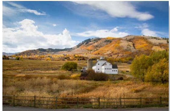
1 st Place Utal Farm Brenda Fishbaugh