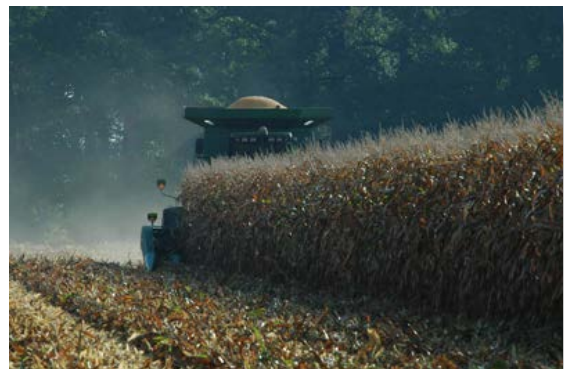
3 rd Place Corn Harvest Sharon Gerig