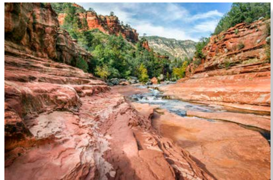
2 nd Place Sedona Swim Hole Denise McQuillan