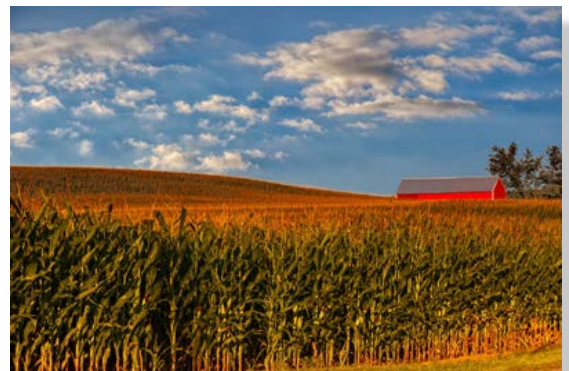
3rd Place Nature's Corn Belt Sharmalene Gunauardena